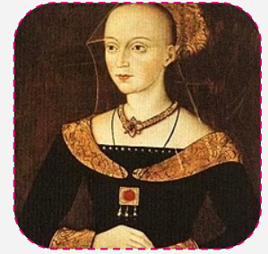
Elizabeth Woodville